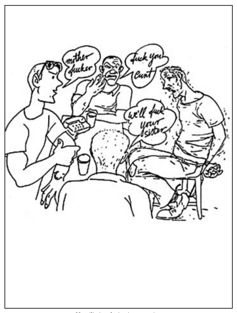
Humiliation during interrogation

transfer me to the cell... in the morning they would bring me into the interrogations room again and seat me on a chair with my hands tied behind me. ^{56}