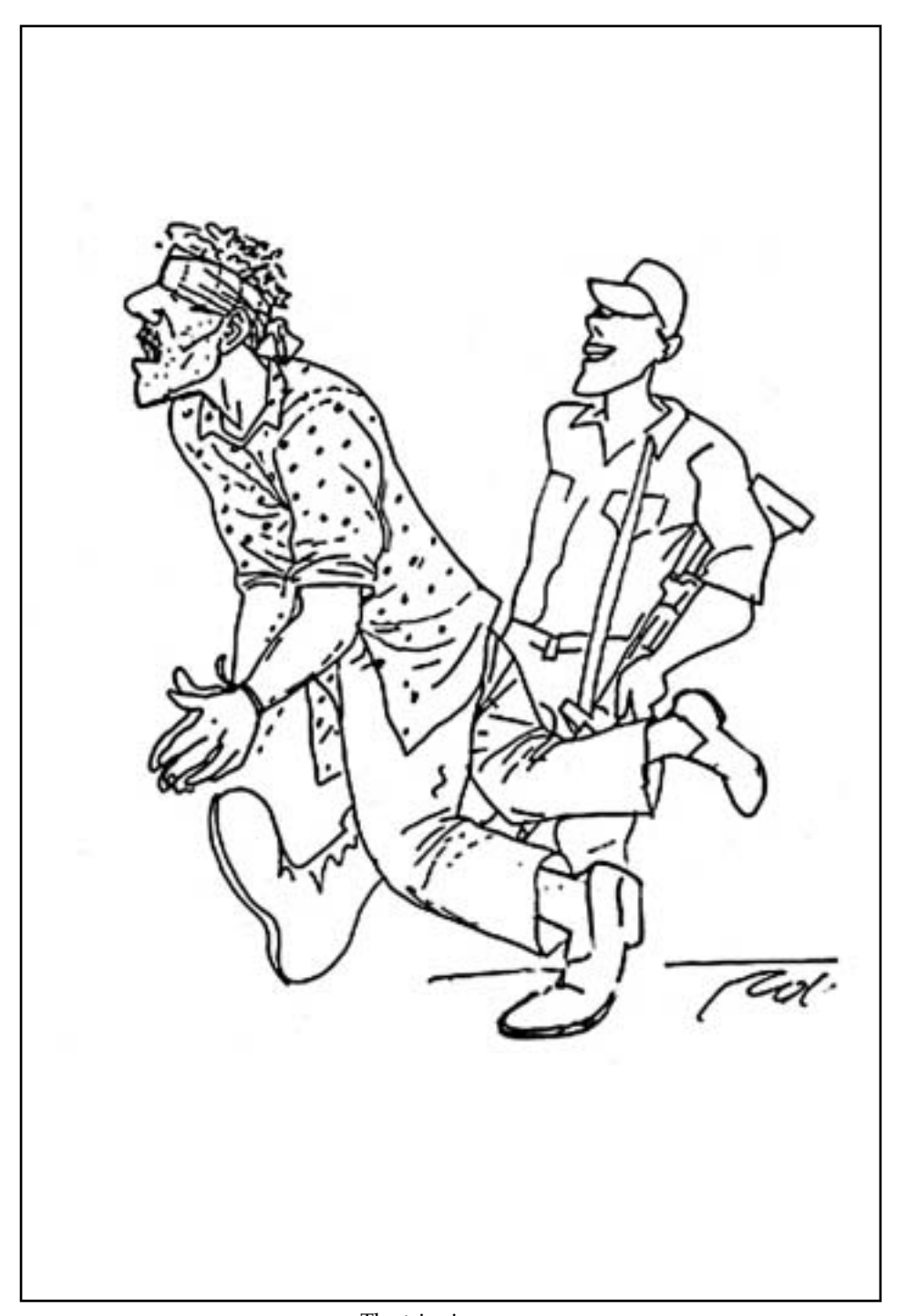
The tripping game