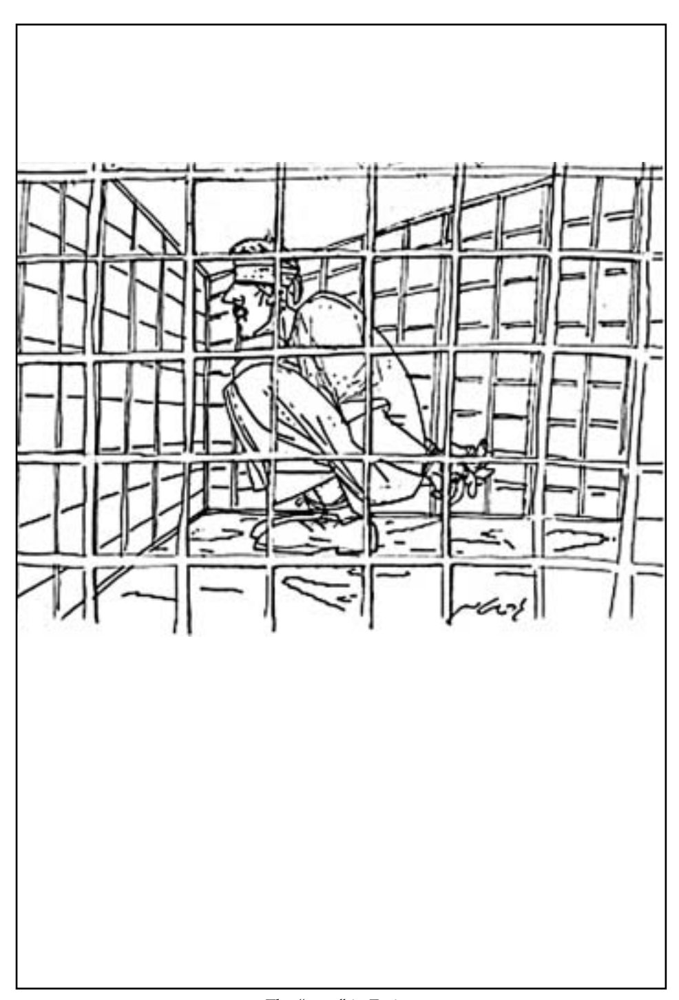
The "cage" in Etzion