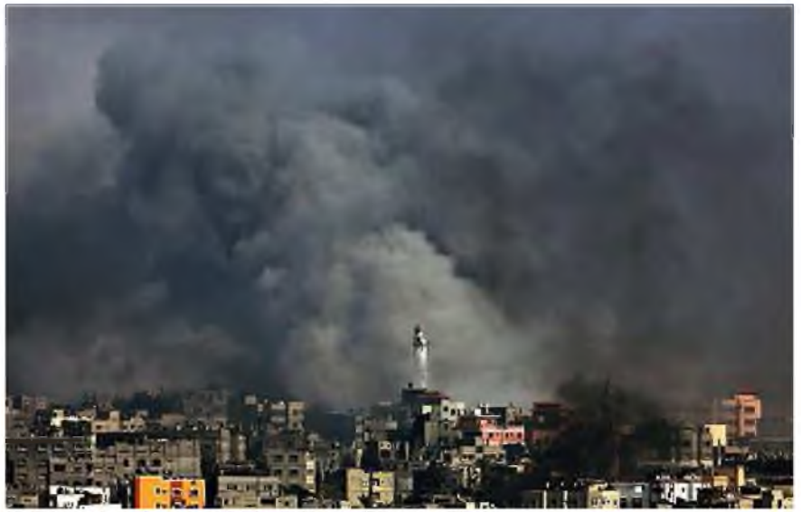
IDF bombardment of Shuja'iyya

As dozens of fighter jets bombed the targets, most of them abandoned by civilians, the ground troops were at a safe distance.